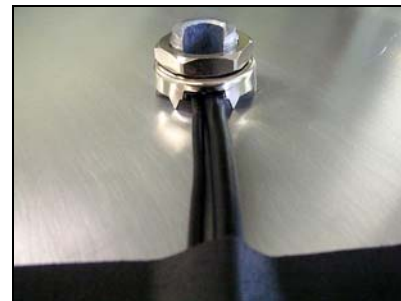
FIGURE 3: CABLE ROUTING