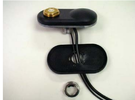
FIGURE 1: PARTS